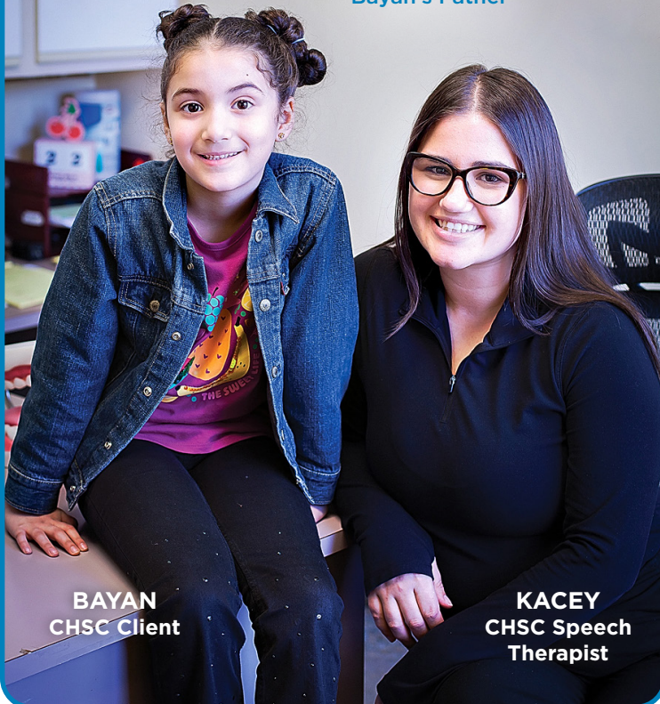
BAYAN CHSC Client